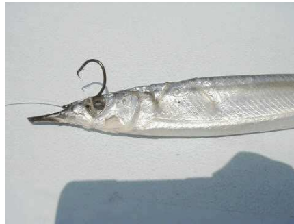
Circle hook rig.

Also, the SSC said that it will award bonus points for sailfish and other billfish caught and released in the club's other